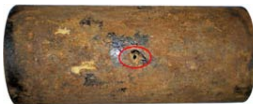
Piece of damaged pipe. The cone-shaped hole is evident in the centre of the pipe.

The morphology of the damage induced us to classify it as a corrosion phenomenon due to stray currents , which happens when an electrical current accidentally passes through a component. The corrosion takes place in those spots where the electrical current "leaves" the component to "return to" the original power line. In this specific case, the electrical current had entered the pipes near a railway line that crossed the refinery.